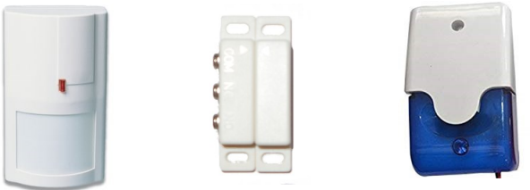
Security Devices (subject to change)